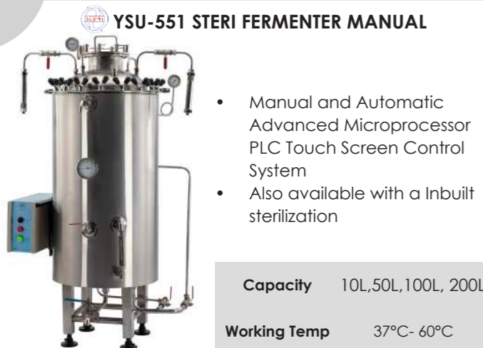
YSU-551 STERI FERMENTER MANUAL