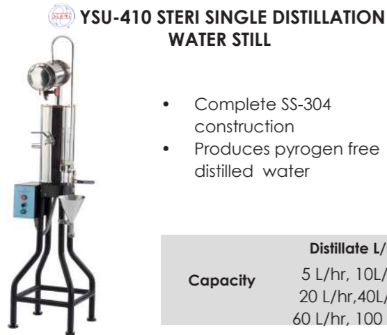
YSU-410 STERI SINGLE DISTILLATION WATER STILL