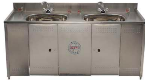
YSU-1150 STERI HAND WASH SINK