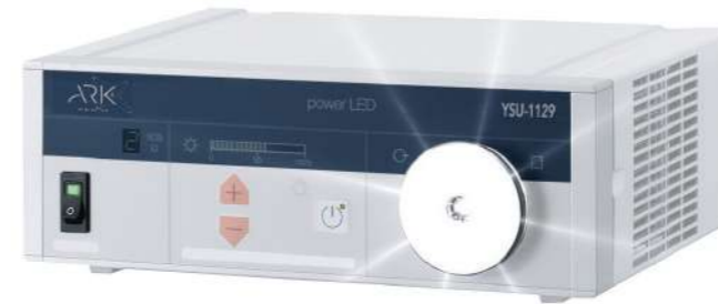
YSU-1129 STERI DIGITAL LED LIGHT SOURCE

STERI in collaboration with ARK has developed a series of high feature low cost medical led light source for Laparoscopy , Endoscopy , ENT , Dental etc.