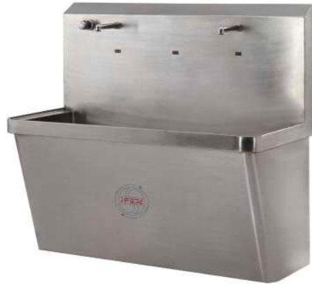
YSU-615 STERI SCRUB STATION