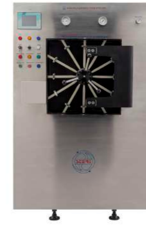
YSU-608 STERI AUTOMATIC STEAM STERILIZER