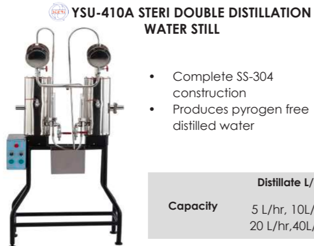
YSU-410A STERI DOUBLE DISTILLATION WATER STILL