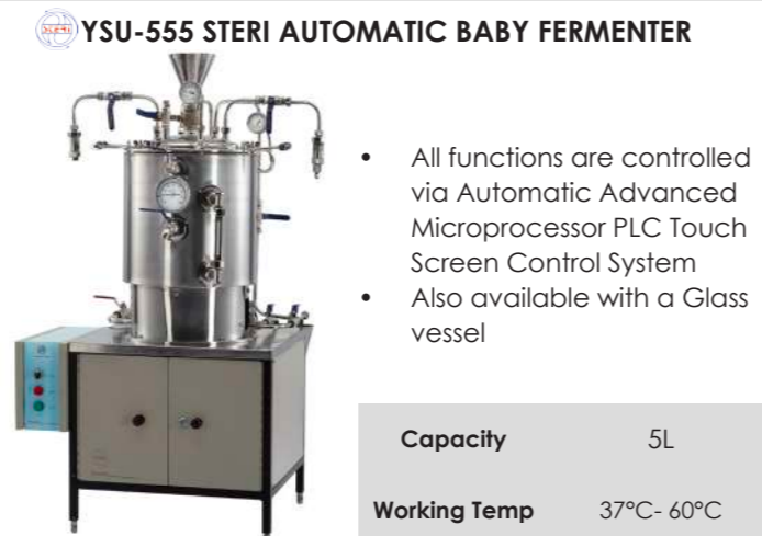
YSU-555 STERI AUTOMATIC BABY FERMENTER