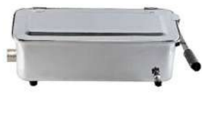
YSU-900 STERI INSTRUMENT STERILIZER