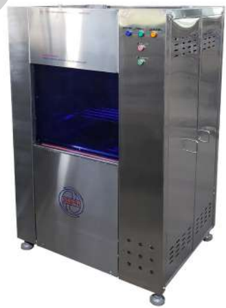
YSU-609 STERI DISINFECTOMAT WASHER DISINFECTOR