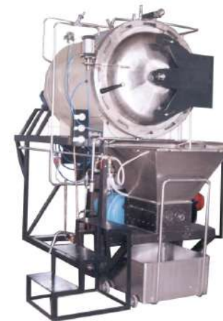
YSU-611 CYLINDRICAL MEDICAL WASTE STERILIZER WITH SHREDDER