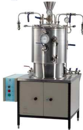
YSU-555 STERI AUTOMATIC BABY FERMENTER