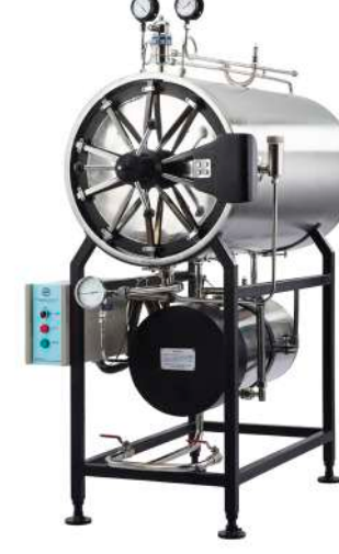
YSU-405 STERI HORIZONTAL STEAM STERILIZER