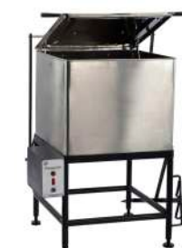
YSU-613 STERI BOWL STERILIZER