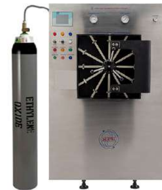
YSU-606 STERI ETO HORIZONTAL STERILIZER