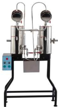
YSU-410A STERI DOUBLE DISTILLATION WATER STILL