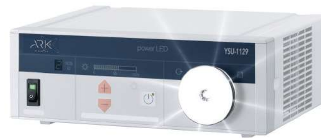
YSU-1129 STERI DIGITAL LED LIGHT SOURCE

STERI in collaboration with ARK has developed a series of high feature low cost medical led light source for Laparoscopy , Endoscopy , ENT , Dental etc.