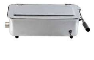
YSU-900 STERI INSTRUMENT STERILIZER