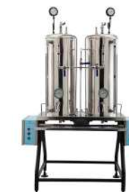
YSU-409 STERI HOT & COLD WATER STERILIZER