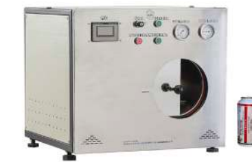
YSU-406 STERI ETO TABLE TOP STERILIZER