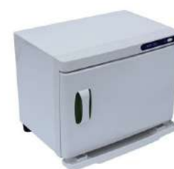
YSU-701 STERI UV STERILIZER