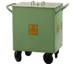
BIO HAZARD TROLLEY