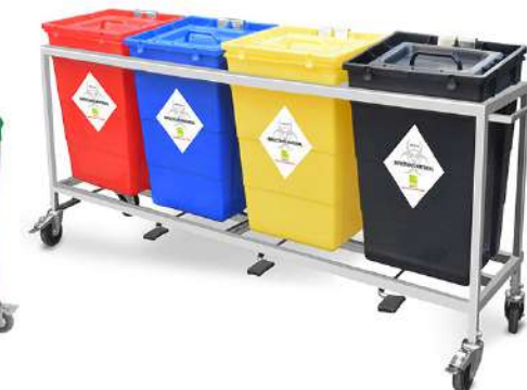
WASTE SEGREGATION TROLLEY