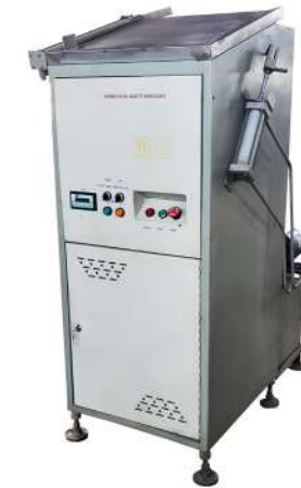
YSU-612 WASTE SHREDDER