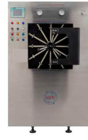
YSU-608 STERI AUTOMATIC STEAM STERILIZER