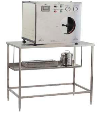
YSU-617 TABLE TOP PORTABLE AUTOCLAVE