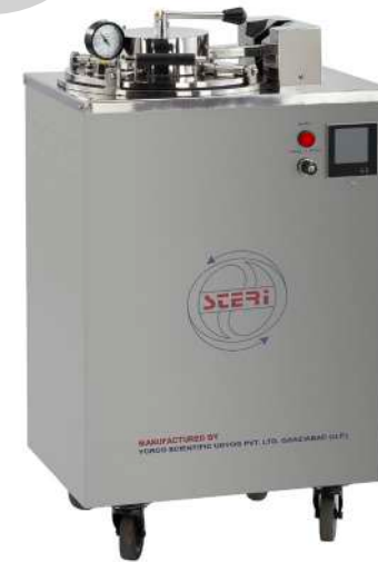
YSU-404 STERI VERTICAL STEAM STERILIZER