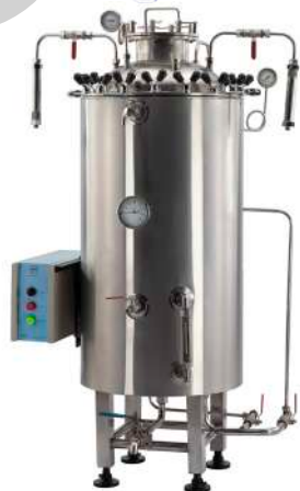
YSU-551 STERI FERMENTER MANUAL