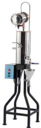
YSU-410 STERI SINGLE DISTILLATION WATER STILL