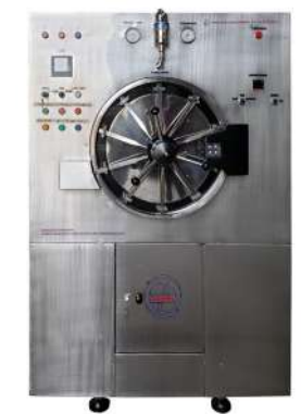
YSU-607 STERI FORMALDEHYDE STERILIZER