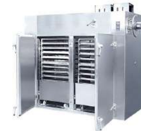
YSU-623 STERI DRY STERILIZER