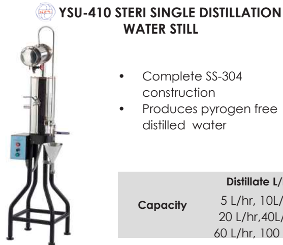
YSU-410 STERI SINGLE DISTILLATION WATER STILL