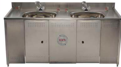
YSU-1150 STERI HAND WASH SINK