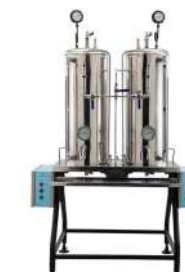
YSU-409 STERI HOT & COLD WATER STERILIZER