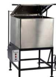
YSU-613 STERI BOWL STERILIZER