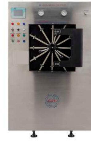
YSU-608 STERI AUTOMATIC STEAM STERILIZER