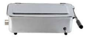
YSU-900 STERI INSTRUMENT STERILIZER